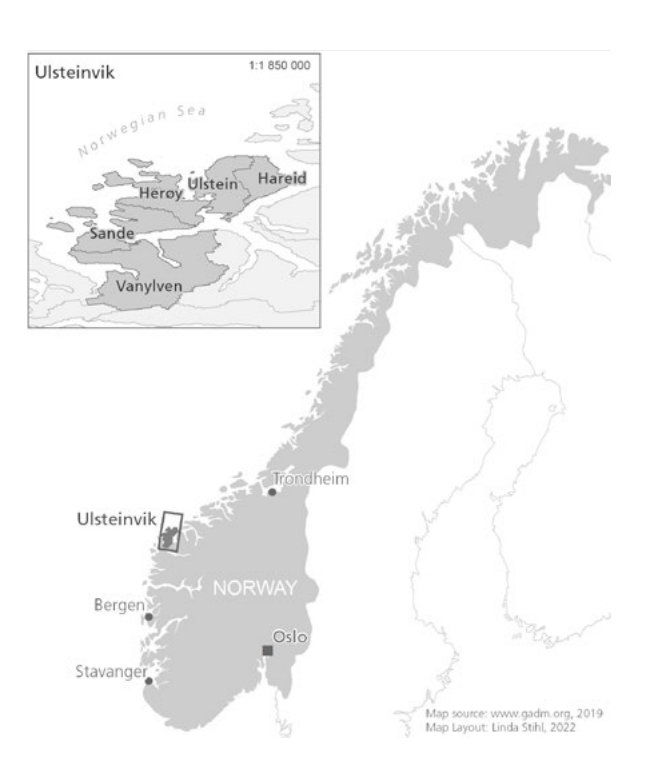
Figure 1: Geographic location of study area

Small- and medium-sized firms targeted different market segments and turned profitable faster after the crisis hit. Yet, large and mainly family-owned firms were essential not only in terms of employment and as a source of demand, but also as innovators and taking a leadership role in building the regional environment.