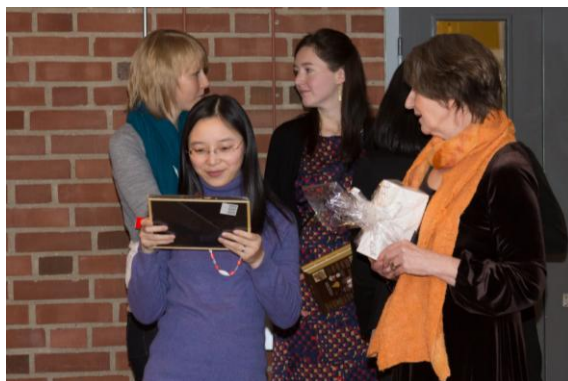
Surprises in the Christmas Lottery

The main goal of the CIRCLE Social Capital Committee (CSCC) is to create a better work environment, wherein all staff members of CIRCLE feel more integrated and part of a community. In 2012, under the umbrella of the CSCC, various activities were organized such as a barbeque for all CIRCLE members and their families, a “predict the scores”-game during the European Football Championship and the yearly Secret Santa Christmas lottery.