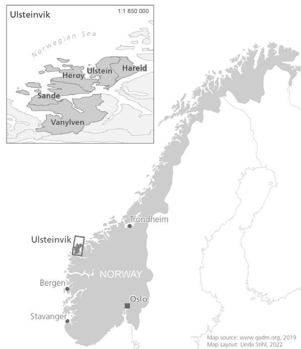
Figure 1: Geographic location of study area

Small- and medium-sized firms targeted different market segments and turned profitable faster after the crisis hit. Yet, large and mainly family-owned firms were essential not only in terms of employment and as a source of demand, but also as innovators and taking a leadership role in building the regional environment.