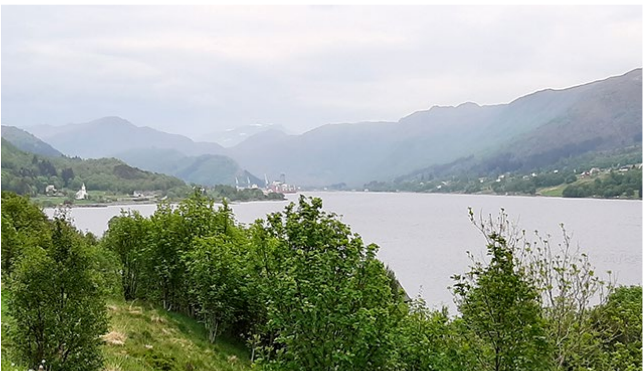
Photo from Sunnmøre